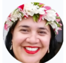
Ngā mihi nui

Na noqu vosa me na tekivu mai vale My language starts from home